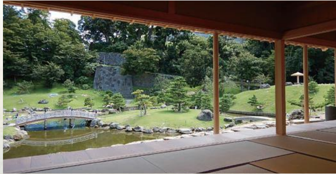
View from the tatami-floored room

The Gyokusen'an Rest House, which provides a panoramic view of the garden, is located where there was once a government office engaged in the maintenance and management of the garden during the Edo era (1603–1868). In addition to being a place to take a break, the Rest House also has an information desk and a tatami-floored room, which can be used as a tea room. Tea service is available at the Japanese-style room, and the room can be used for including authentic tea ceremonies.