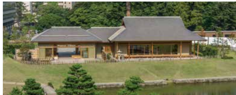
Gyokusen'an seen from Imori Hill