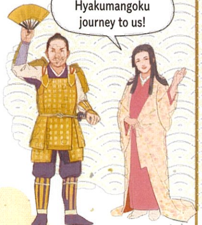
Maeda Toshiie and Matsu