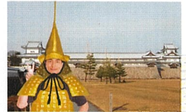
Try on the warrior helmet used by Maeda Toshiie