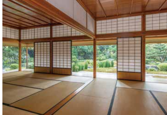
Restored tea room overlooking roji

The villa, which was rebuilt by the 6th lord Yoshinori, was located in front of the current fountain up until its destruction at the beginning of the Meiji era. During the latter half of the domain's rule, it was also called Shiguretei. In March 2000, it was restored at its current site. The 10-mat and 8-mat zashiki (tea rooms) facing the garden and the connecting okakoi (small tea room) were restored based on the floor plan preserved from that time.