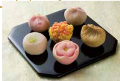
Original seasonal Japanese sweets