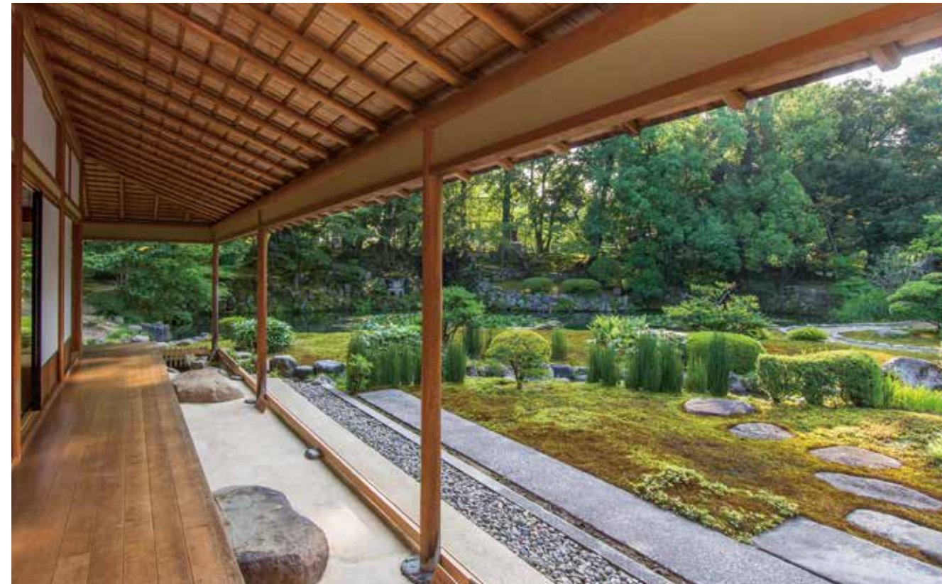
Roji (tea garden) view from Nure-en porch